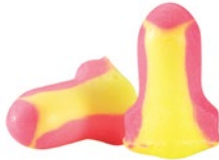
Laser Lite® Highly visible protection

NRR 33 MAX1-USA MAX30-USA CAN A(L) uncorded corded