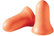
Max Small® Comfort for smaller ear canals

NRR 30 LPF-1 LPF-30 CAN A(L) uncorded corded